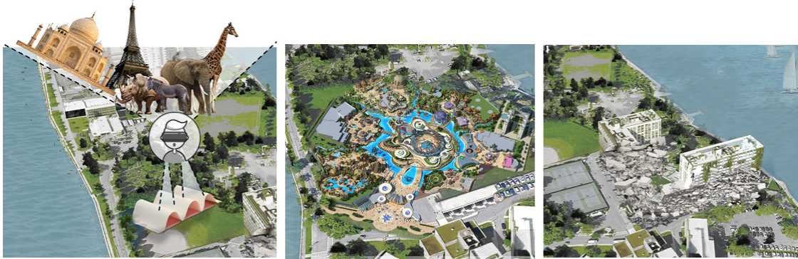
Figure 2: Youth proposals rendered on the Pinnacle (an alias for an island condominium) site: virtual reality zoo/cultural center (left), spa kingdom (middle), and destroying the Pinnacle (right). Renderings produced by authors

In the following two sections, we narrate the internship process chronologically, focusing on two ethnographic episodes: 1) the students' design proposals, and 2) their presentation of these proposals at the senior center. After each episode, we discuss the key observations and findings that resulted. In the subsequent sections, we synthesize the themes and ideas appearing across the episodes, and their implications for design theory and pedagogy.