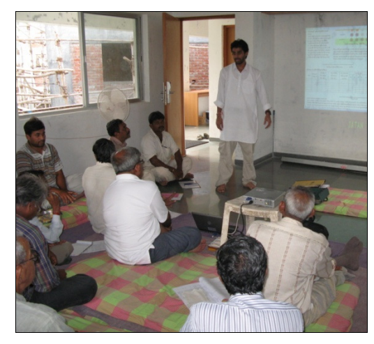
Figure 2: The first author presenting JCS to farmers.

There were many issues raised that revealed the limitations of JCS. The scorecard content, namely the criteria and their corresponding options, created contentious discussion. Assigning weights was difficult as determining relative values to incomparable farm characteristics are somewhat arbitrary. One farmer expressed concern that the wide variation of climatic characteristics just within the state would result in regionally skewed scores, and suggested a separate region-specific weighting of various criteria. Many made the point that providing multiple-choice options could introduce subjectivity to the scoring process, as appraisers could have different interpretations for certain options. A large group of farmers requested that a minimum