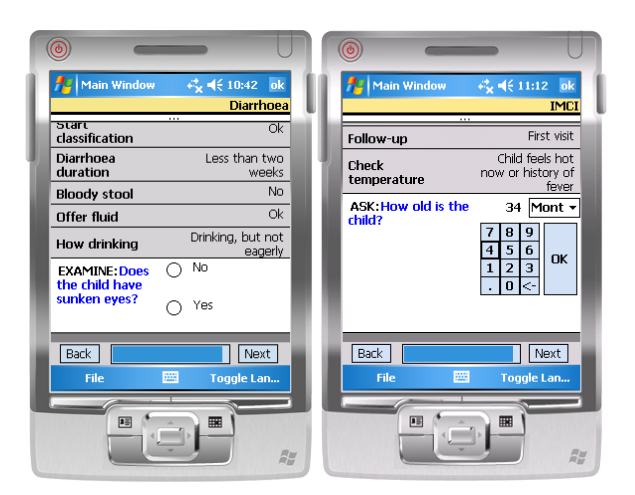
Figure 1: The e-IMCI interface.