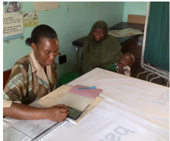
Figure 3: Clinician using e-IMCI prototype with a patient.

Next, we observed each clinician delivering care as s/he would normally to gather data on the adherence to the IMCI protocol, the time it takes to deliver IMCI, and current clinical practices. For consistency, we gathered data only